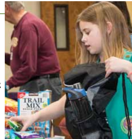
Local Girl Scouts and other volunteers helped create homeless-teen backpacks at PROP, as part of a program funded by the Foundation and A.M. Rotary.

It shows that we do things better when we do them together! Your support of the Foundation makes collaboration like this happen.