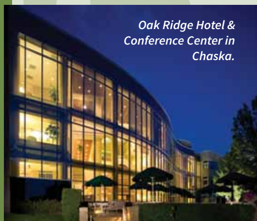
Oak Ridge Hotel & Conference Center in Chaska.

Our annual party celebrating a year of philanthropy and our newest grantees will be held at Oak Ridge Hotel & Conference Center in Chaska on the evening of Saturday, April 29.