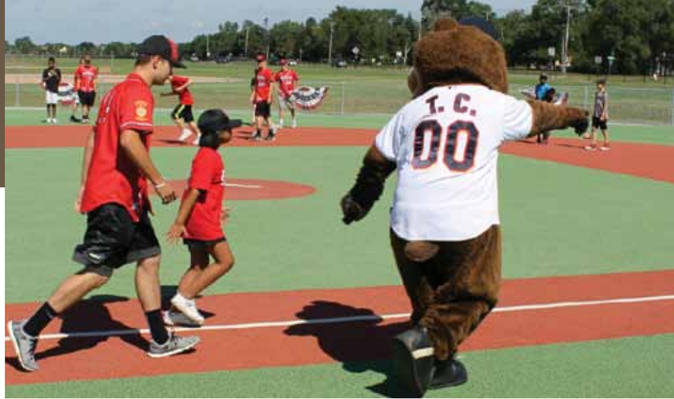
Eden Prairie Miracle Field was finished and put to use starting this past summer. Money to pay for its construction is still being raised.

They brought the idea back to Eden Prairie, got help from the City of Eden Prairie and the Eden Prairie Community Founda-