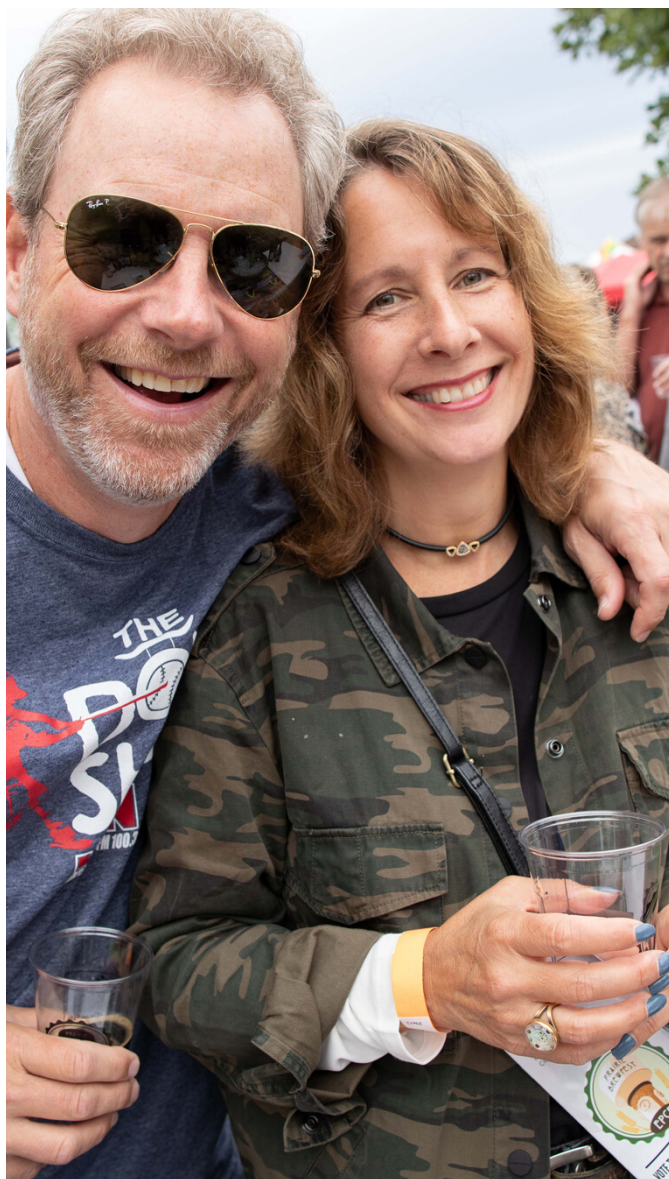
Every year brings a new attendance record for Prairie Brewfest.