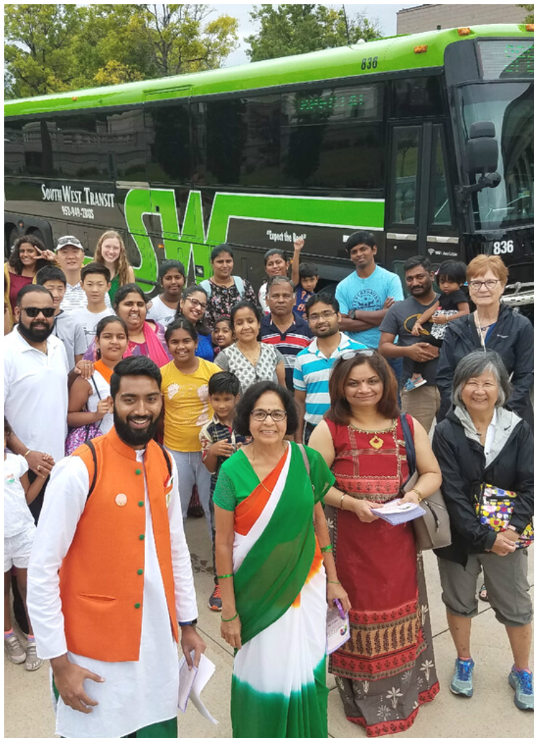
EPCF was a proud supporter of PeopleFest and its field trip to IndiaFest last year.

Your support always goes beyond the Foundation, because we collaborate with other groups to reach more people.