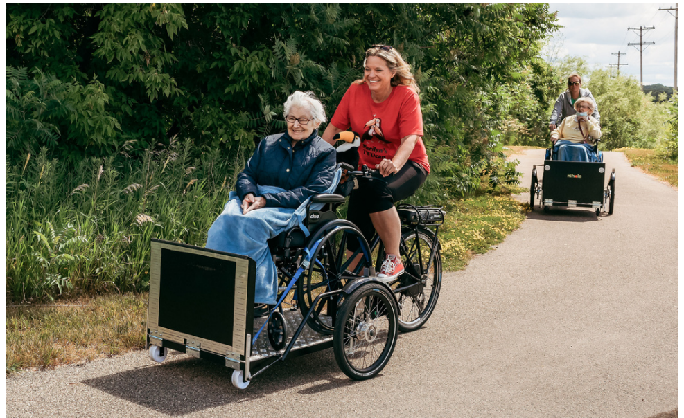
Community-impact funds, such as the Marilyn's TWOcan Fund, which supports bike rides for older adults in senior communities, extend the Foundation's charitable work.

CounterAct Fund Eden Prairie Local News Fund Eden Prairie Reads Fund EP Schools School Supply Fund Friends of the EP Players Fund Interfaith Circle Fund